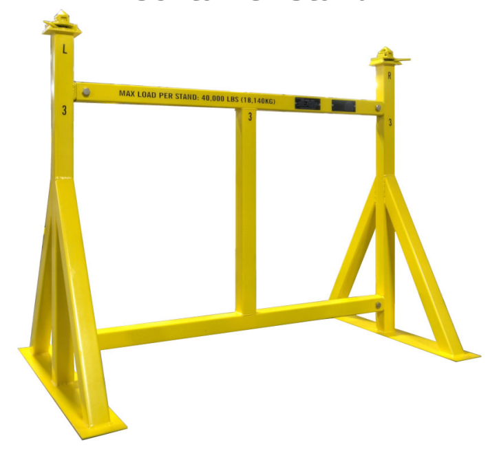
Dimensions below shown in inches