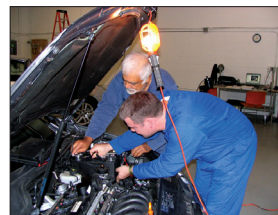
Bentley technical editors working on a 2005 Jetta.

Volkswagen A5 platform Jetta familiarization section